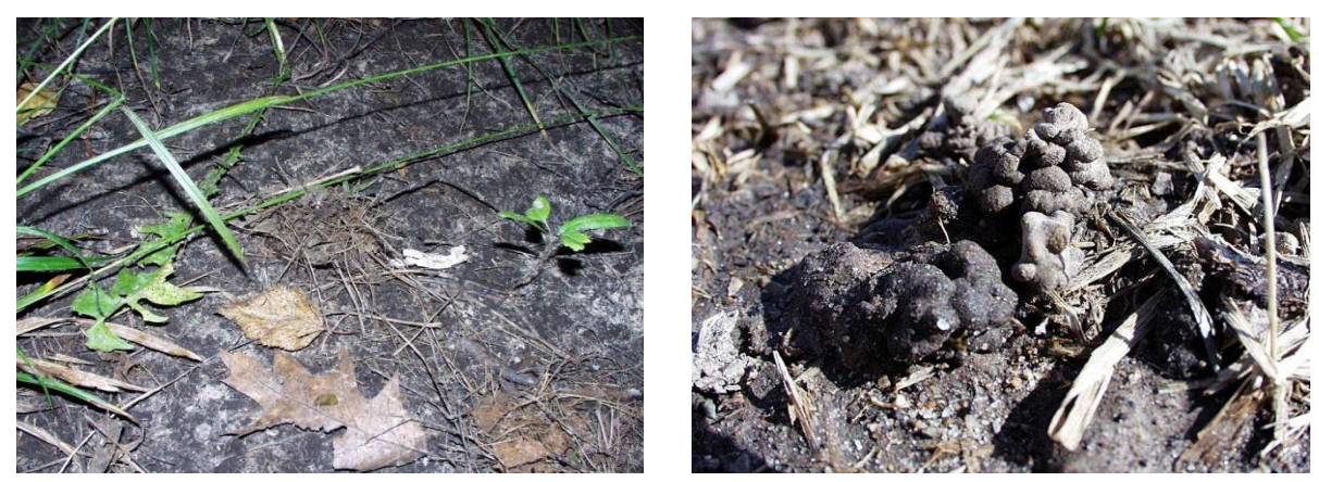
Earthworm middens with the stems of eaten leaves sticking out and piles of castings around the burrows. Notice the lack of leaf litter surrounding the middens.