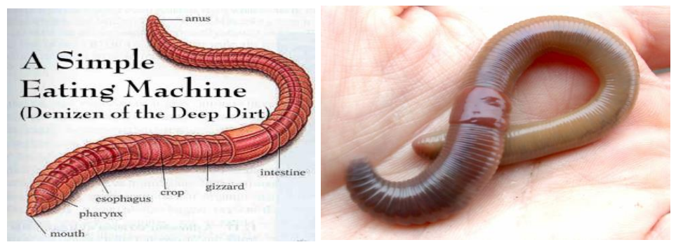
Worm anatomy and a photo of an endogeic earthworm, the leaf worm.