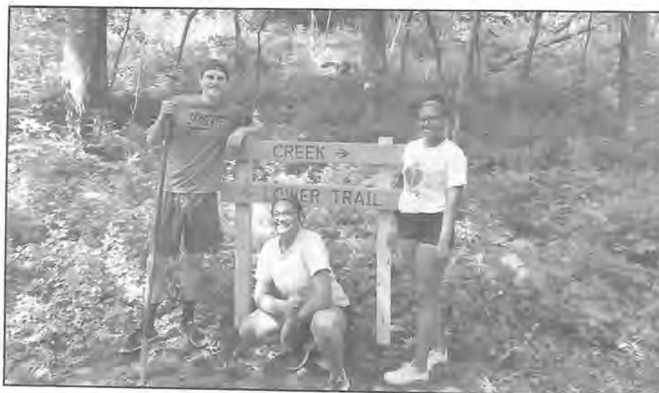
Left, a student shows off the fish she caught in Marsh Creek during the Nature Navigators program, while right, students pose with the trail sign they helped install at the JSOL property.