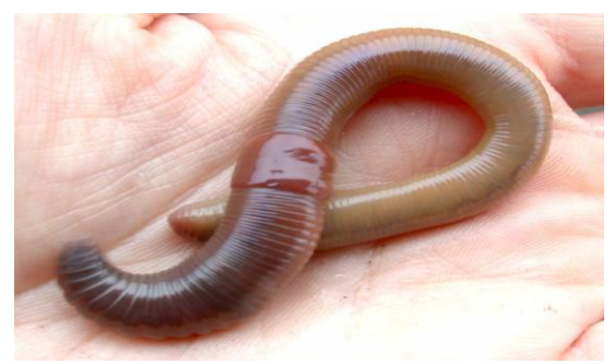
Photos from left to right: worm anatomy; an endogeic earthworm - the leaf worm.