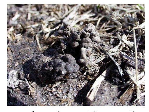
Photos from left to right: Earthworm middens with the stems of eaten leaves sticking out; piles of castings around the burrows. Notice the lack of leaf litter surrounding the middens.