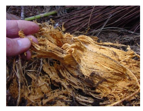
Photos from left to right: Young, popcorn like fruit bodies; older fruit bodies; decayed wood.